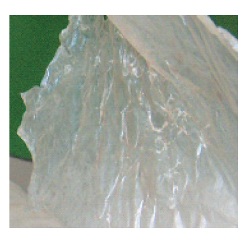
Fig. 3. Novel dried amniotic membrane (Hyper-dry-amnion) was developed using far-infrared rays and microwaves, in addition to \gamma -irradiation for sterilization (M. Okabe, manuscript in preparation). The boiling temperature could be decreased under the low-air-pressure condition. Thus, we could decrease the degradation of tissue-protein as much as possible.